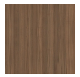
Veneered wood Walnut Canaletto